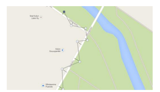
\textbf{Fig. 6} : \ Path \ of \ the \ GPS \ location \ updates \ with \ closest-to-road \\ vectors.

GPS data inaccuracies are eliminated by calculating the closest possible location for avatar on top of the road, which effectively disallows the avatar to be located inside buildings or other structures (Figure 6). This is crucial because city venue contains lots of tall buildings and running on the sidewalk close to these buildings causes GPS sensor to have multipath issues.