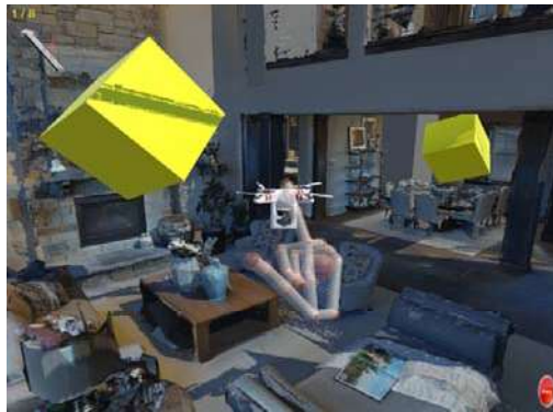
Figure 2. Controlling a UAV with finger-based gestures in a simulated environment.

FRs employ UAVs to assist them in several tasks while operating, including risk detection and victim localization. Typical UAV remote controllers tend to be heavy and cumbersome, require both hands to operate and have a significant learning curve. This is often contrary to the needs of FRs who may need to carry other important equipment and need to keep their hands free during a mission for other tasks. Considering the above, FASTER will introduce vision-based gesture control allowing FRs to fly UAVs in an intuitive and effective manner, without compromising their freedom of movement, safety, and ability to carry out their mission.