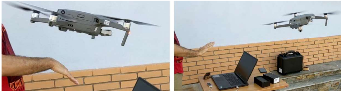
Figure 3. Pitching forward (left) and backward (right) with the DJI Mavic 2 using palm-based gestures.

commands. The UAV is controlled by a mobile device connected to the remote controller and running DJI's mobile SDK. Early test flights with both novice and experienced FR UAV pilots indicate that gestures provide easier and more intuitive control compared to the hand-held controller while allowing the same range of control and maneuvering.