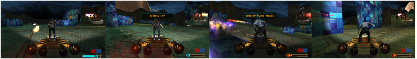
Fig. 1. Screenshots of the video game taken from the players' clients.

serves tenants/service providers, so called 5G multi tenancy feature, will significantly reduce the required CAPEX for service offering. Last but not least, SDN/NFV create an open ecosystem where a full choice of modular plug-ins can be easily adapted to customize service offering according to the user needs.